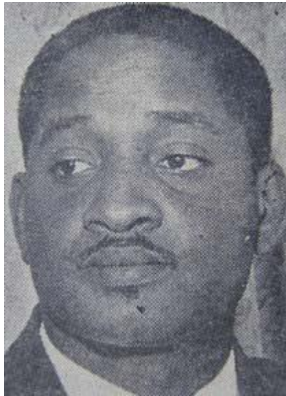
A young Forbes Burnham.

I couldn't see it at the time. Forbes and I were very close. As brother and sister, we shared many, many good times and confidences. I was not old enough to understand or appreciate what was happening in his life and character.