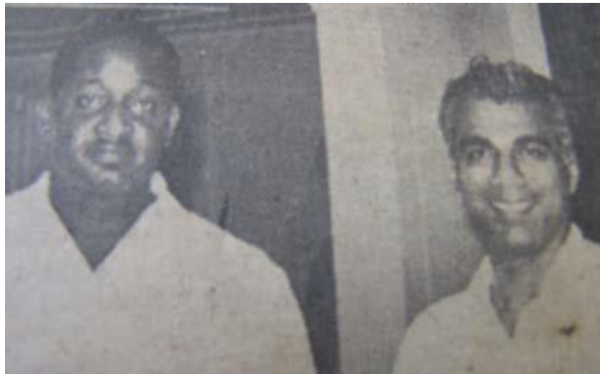
Forbes Burnham and Dr. Cheddi Jagan

Today, he runs his Party like the way King Christopher once ran Haiti. While terror is no stranger to our country, it has never been used to suppress FREEDOM, the liberty of speech, worship and the press. Would these freedoms continue under my brother? It is my concern in this area...personal individual freedom...that causes me to say to my people, to Guyana, “BEWARE, MY BROTHER, FORBES. Watch carefully to whom you hand your Government.”