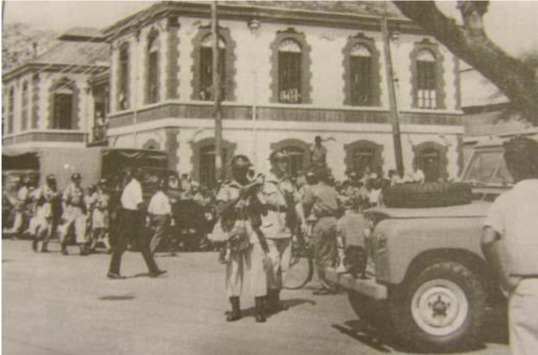
Election year in 1964; troops in the city just outside the courts and parliament buildings.