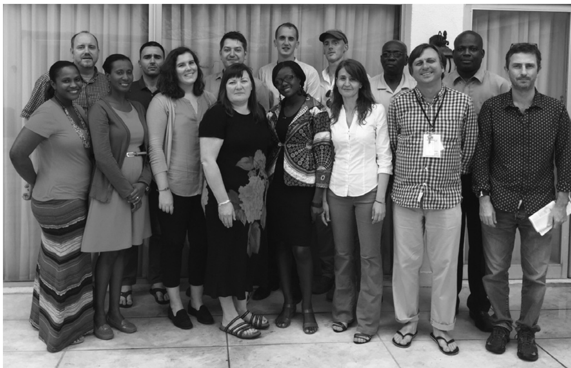
The Carter Center

Carter Center observers and staff on this mission had the privilege of working on the Center's 100th election observation.