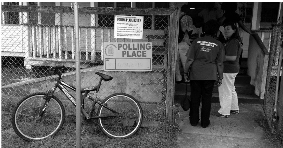
The Carter Center