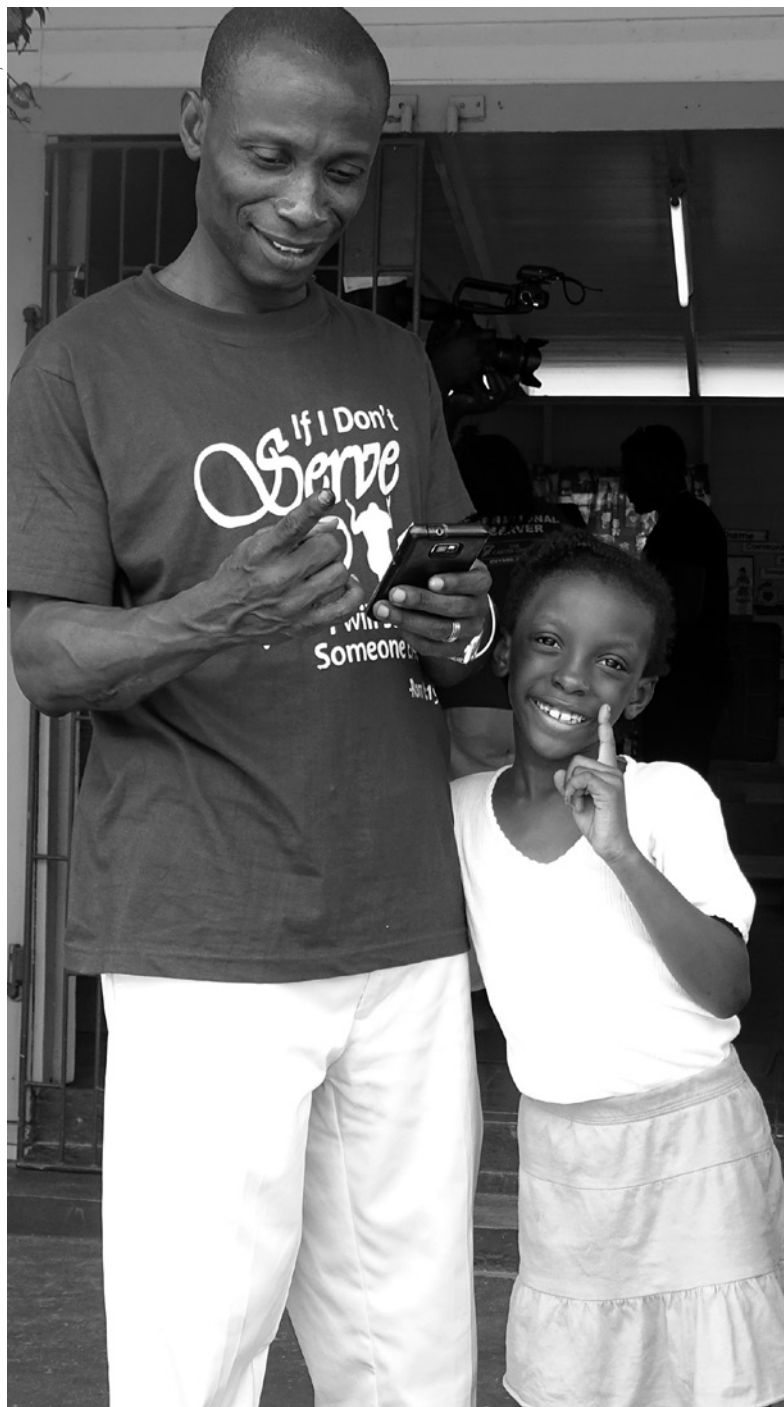
A young future voter is proud to stand by her father, who shows his ink-stained finger that indicates he has voted.