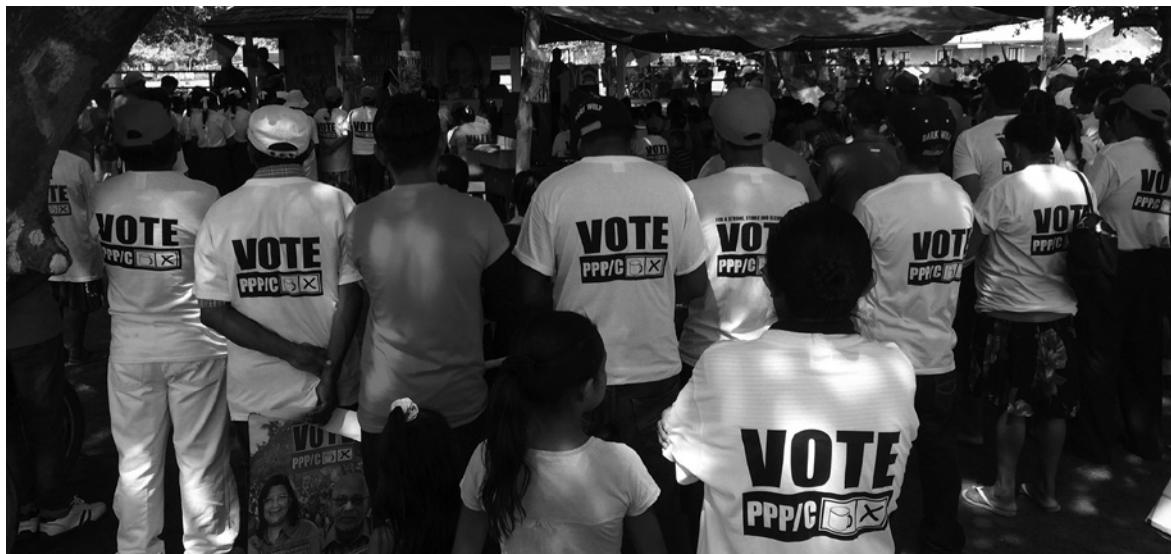
The Carter Center observes a rally of the incumbent People's Progressive Party/Civic. The party had been in power for 23 years prior to this election.

The only legal requirement for a party to participate in elections is to field lists in at least six of the 10 districts. Six parties, including one coalition, submitted lists for the National Assembly elections. In addition to the People's Progressive Party/Civic and APNU-AFC, these were the United Force, the United Republican Party, the Independent Party, and the National Independence Party. Two additional parties, the Healing the Nation Theocracy Party and Voice of the People, fielded candidates for the regional elections in Region 4. Although six national lists participated in the election, the two largest blocs garnered almost the entire attention of the media. The smaller parties' campaigns were largely invisible, with very low levels of activity. The two main parties, by contrast, were extremely visible.